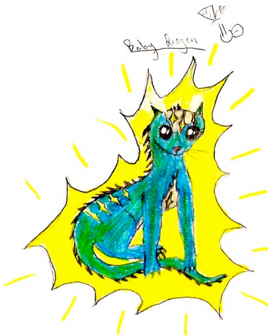
Drawing by Ruby S-T, 5th grade, Room 1